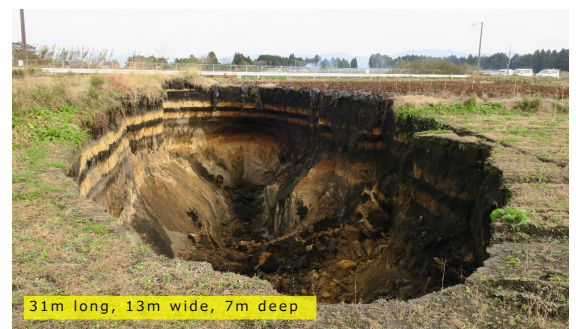
Sinkhole caused by internal erosion in volcanic "Shirasu" layer in Miyakonojo, Miyazaki (Sept. 2016)

By repetition of erosion and failure of cavity ceiling, a cavity moves upward